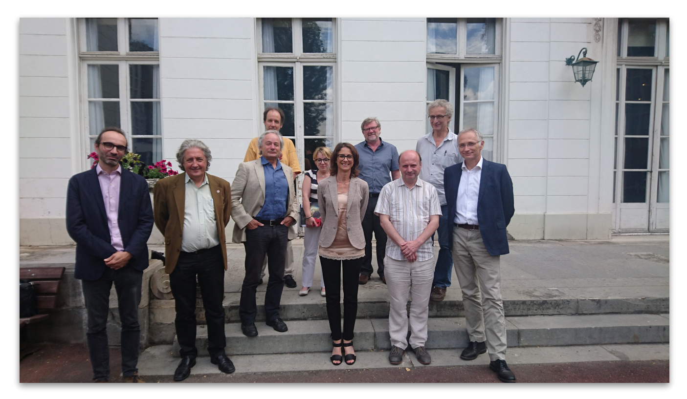
Participants to the SKA-France Workshop of May 31, 2017

SKA-France has organised on May 31, 2017, the first meeting of a working group to discuss about the possible evolution of the SKA-France coordination towards a more extended partnership between public research institutes and private companies.