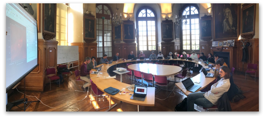
Participants in one of the Hands-on sessions of the LOFAR/MeerKAT/NenuFAR Workshop