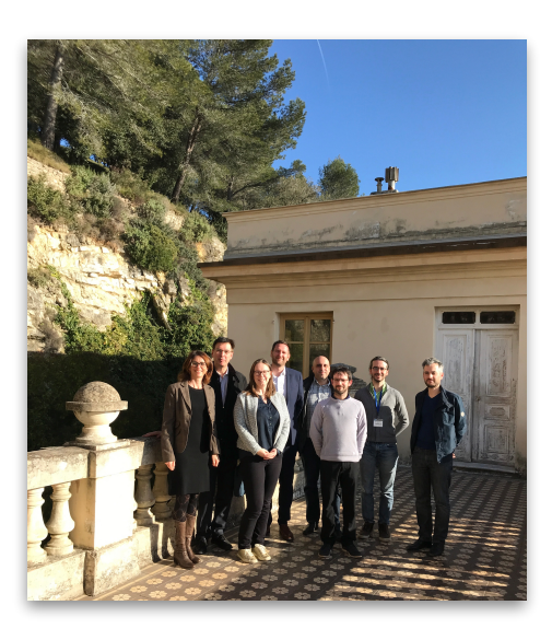
Participants to the meeting at OCA

On February 28, 2019, another meeting took place at Paris Observatory to prepare follow-up actions of the project "SKALLAS" (SKA paraLLel Architecture & Software). This SKA-related project, aiming at developing an adequacy algorithm architecture approach to implement new imaging and calibration methods for the SKA by respecting constraints of energy consumption, throughput, cost and calculation precision, was funded within the 2018 call for projects in Astro-Informatics launched by the Interdisciplinary Mission of CNRS and has been resubmitted in 2019 after a successful accomplishment of the first year of work.