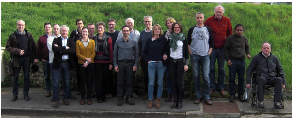
Participants to the French SKA White Book Meeting

A general meeting between the coordinators of the different chapters of the French SKA White Book was held on March 21-22, 2017, in Orsay. The main aim of the workshop was to finalise the preparatory work for the White Book.