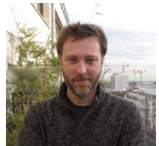
Dr. Marc-Antoine Miville-Deschênes

HyperStars aims at developing optimal methods to extract coherent structures from hyper-spectral observations (i.e., data cubes of line emission) of the interstellar medium. The project will explore original segmentation and clustering methods to identify coherent structures in three dimensions (position, position and velocity), conceive methods to evaluate the quality of the reconstructed information using numerical simulations as benchmark tests, and develop implementations on multi-GPU architecture foreseeing the analysis of massive datasets of future observatories like the Square Kilometre Array.