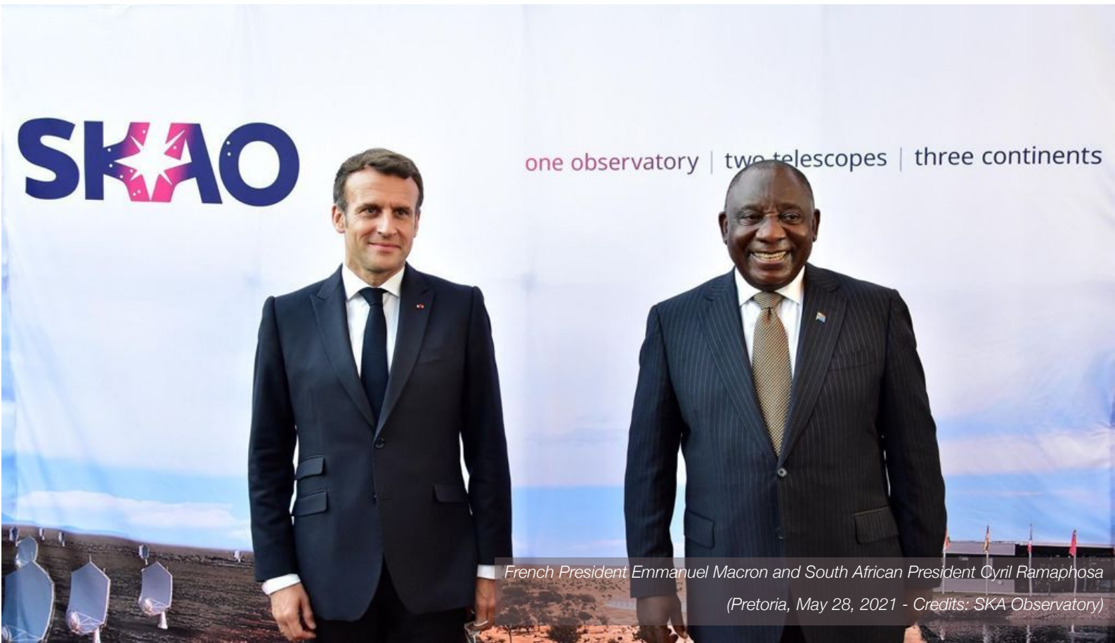
French President Emmanuel Macron and South African President Cyril Ramaphosa (Pretoria, May 28, 2021)