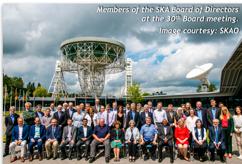
Members of the SKA Board of Directors at the 30 th Board meeting.

The 30 th meeting of the SKA Board of Directors was held on July 10 and 11, 2019 at the SKA Global Headquarters (UK), following a two-day face-to-face meeting (July 8 and 9) of the SKA Observatory Council Preparatory Task Force (CPTF).