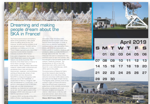
Cover and April pages of the 2019 SKAO calendar

SKA-France has contributed and some French activities are illustrated at the April page of the calendar, which is available on-line .