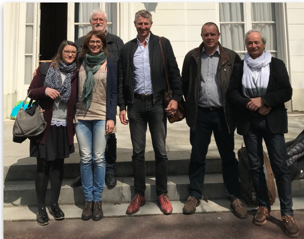
Some of the participants in the meeting between SKA-France and New Zealand SKA Alliance (CNRS Headquarters, April 13, 2018)