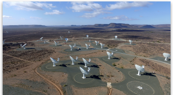
Part of the 64 antennas that will constitute the MeerKAT telescope

After a radio silent period started in 2014, resumed radio emission from this intriguing object was detected by the CSIRO single dish Parkes telescope in April 2017. More than 230 follow-up MeerKAT observations, repeated on 74 separate days from April 27 to October 3, 2017, have been essential to allow radio-derived ephemeris, enabling for the first time the detection of X-ray pulsations from this magnetar through precisely guided X-ray observations with the NASA satellites Chandra and NuSTAR. As described in details in the paper published in The Astrophysical Journal , the combination of all these data provide important indications about the origin of radio emission in magnetars.