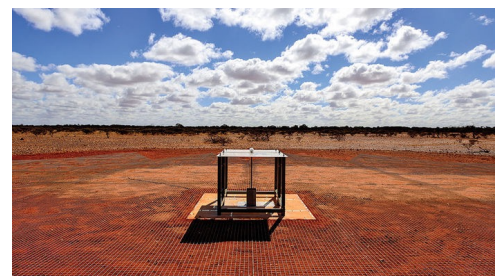
The EDGES antenna