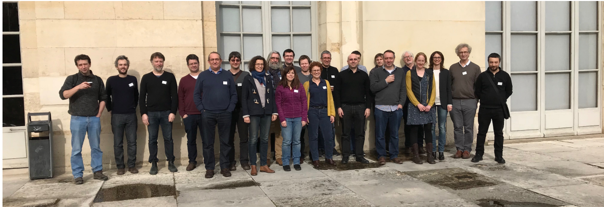
Participants to the SKA-France / INRIA meeting at Paris Observatory